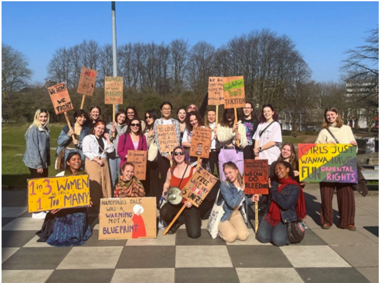
New Team Members